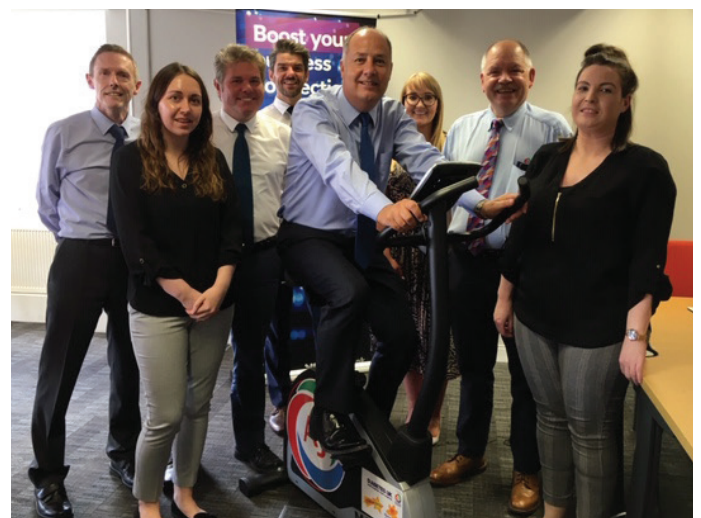
The Commercial Banking Team

If you want to help us raise funds you can make a donation at https://www.sponsorme.co.uk/ajengineering