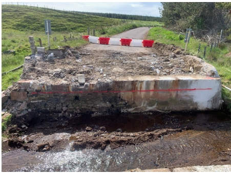
The bridge site at Dykeside