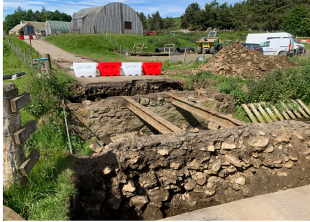
The bridge site at Aldunie

This month, teams from AJ Engineering are expected to be on site to supply and install two bridges which are part of Moray Council's £1.7m road and footbridge spending plan.