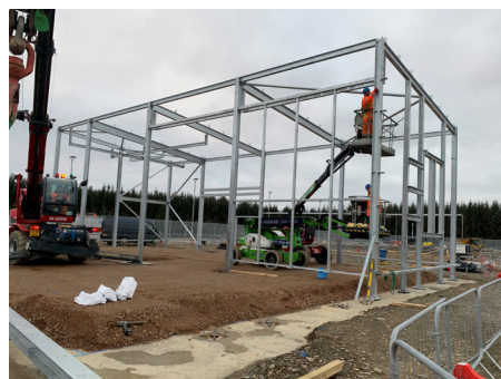
The plans and the start of the build for the substation at Whitehilllock near Keith