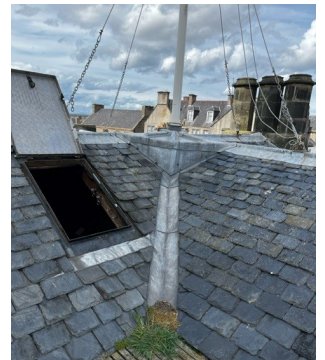
The flag pole