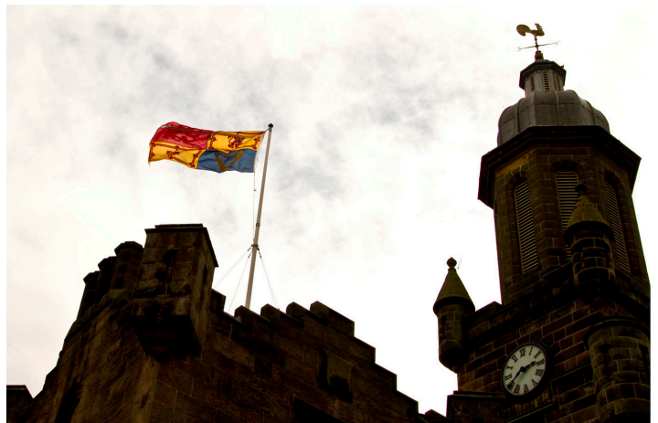
The Royal Standard flying for the Princess Royal visit