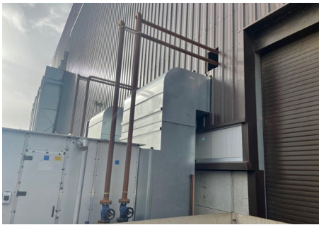
One of the galvanized ducting units

One of the latest projects at West Fraser, which manufactures Oriented