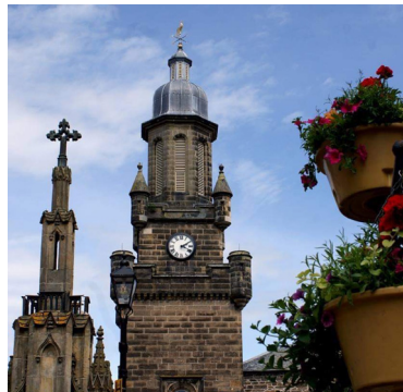
The Tolbooth clock tower

Over the last few years, major renovation works have taken place at the Tolbooth. AJ Engineering was involved in the design, fabrication and installation of a new staircase which gives access to the clocktower which has now been opened to the public for the first time.