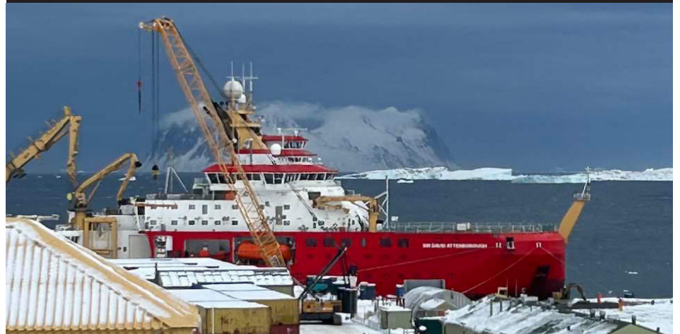
HMS Sir David Attenborough which the team began their journey home on

Two AJE teams are on their way from Antarctica after a second successful stint there.